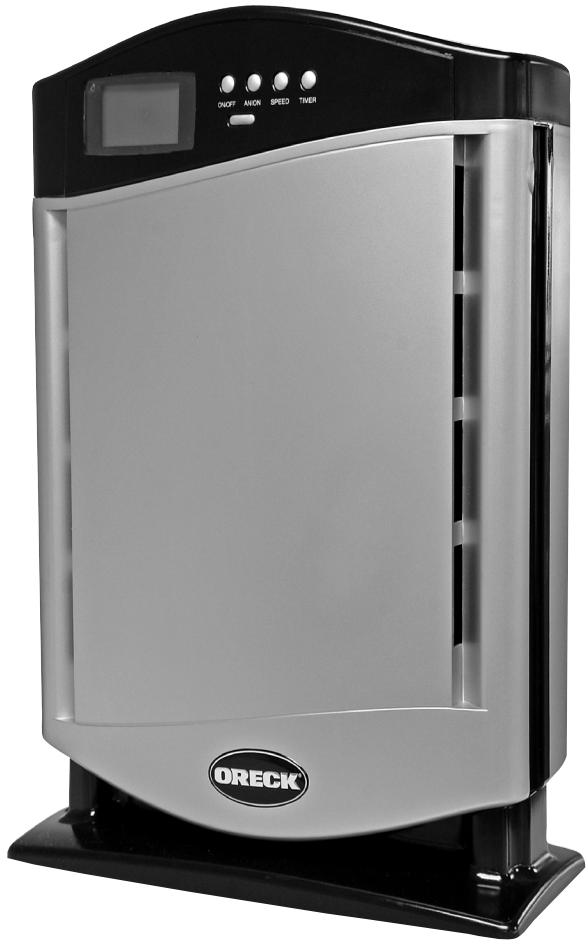
Oreck Air Purifier with HEPA Filtration

Read this manual carefully, and keep for future reference.